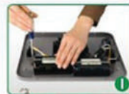
Replacing Power Supply