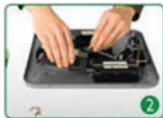
Replacing Power Supply