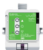
Lutron Vive PowPak [Factory Install] (Option) [FCJS0]