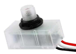
Photocell [Factory Installed] (Option) [WP-PH]