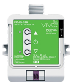
Lutron Vive PowPak [Factory Install] (Option) [FCJS0]