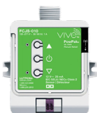
Lutron Vive PowPak [Factory Install] (Option) [FCJS0]