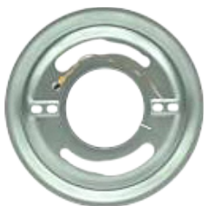
Mounting Bracket (Included)