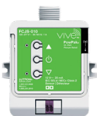
Lutron Vive PowPak [Factory Install] (Option) [FCJS0]