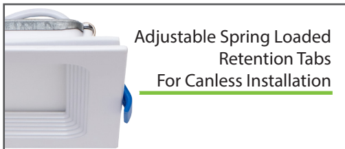
Adjustable Spring Loaded Retention Tabs For Canless Installation