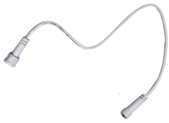
3' or 10' Extension Cable (Option) [TW-EC03, TW-EC10]