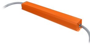
High Voltage Emergency Backup 25W (Option) [90025-H]