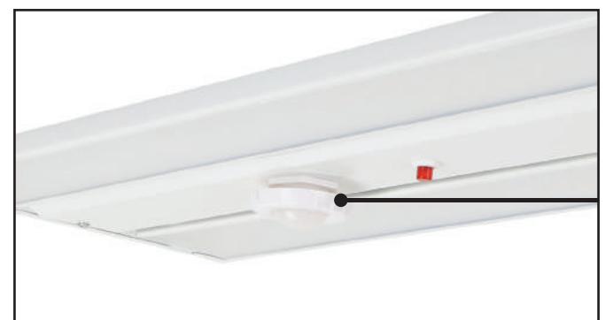
Integrated motion sensor